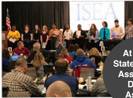
At the Iowa State Education Association's Delegate Assembly