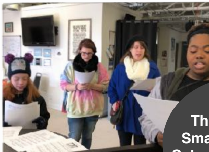
The Avenues Small Business Saturday Caroling