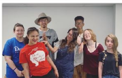
The 2019 Summer Music Academy Songwriting Class

The 2019 Summer Music Academy was a great success, with students from all 5 Des Moines high schools, plus a few middle schools, making amazing things happen not only in lessons but in enrichment classes in Music Theater, Music Theory, Songwriting, Hip Hop, Music Production, and A Cappella. Led by incredible musicians and experts in their fields, our students thrived, learning from the best and from each other, and culminating in some incredible performances. Read more on PAGE 2!