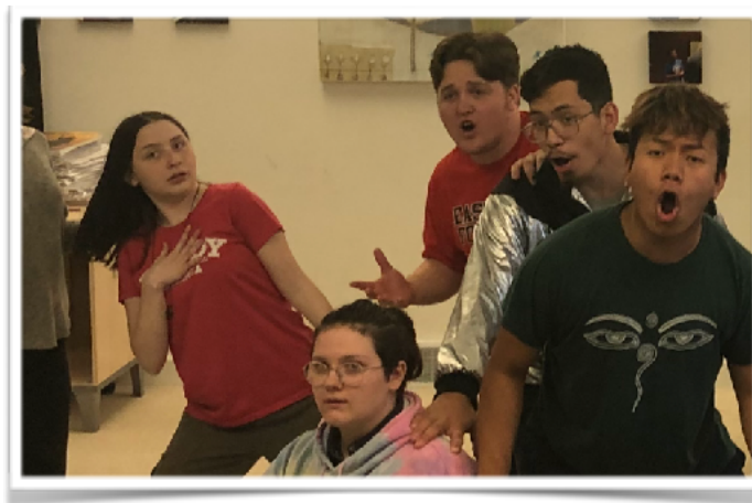
Music Theater Camp Group Number

The 2019 Summer Music Academy was a great success, with students from all 5 Des Moines high schools, plus a few middle schools, making amazing things happen not only in lessons but in enrichment classes in Music Theater, Music Theory, Songwriting, Hip Hop, Music Production, and A Cappella. Led by incredible musicians and experts in their fields, our students thrived, learning from the best and from each other, and culminating in some incredible performances. Read more on PAGE 2!